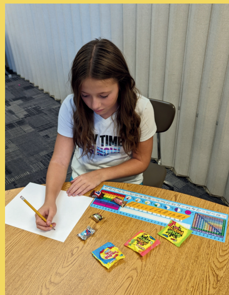
Article and photo submitted by Mr. Kislung

Each of these plans came out unique and showed how difficult a perfect system for classification was.