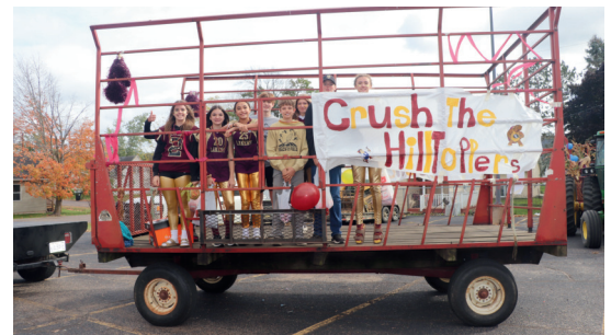
Students rally together during the Homecoming Parade!