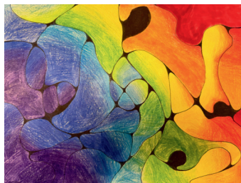
Natalya Frazee Drawing