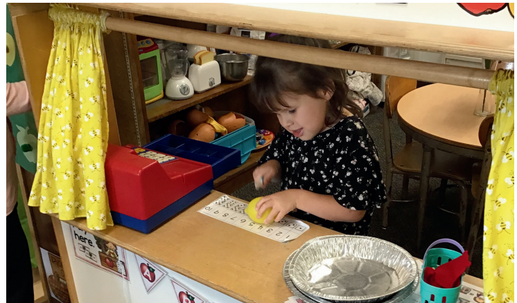
JK article and photos submitted by Jennifer Curtis

We also tasted yummy apples and voted for our favorite apple treat.